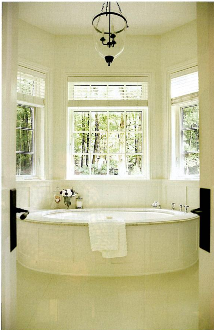
ABOVE: Dramatic double doors open into the stunning ensuite bath, where an oval bathtub with paneled sides awaits in a window bay, surrounded by nature. Brisset kept the bathroom simple to highlight the views and natural light. TOP RIGHT: Robin's-egg blue wallpaper from Schumacher takes the powder room from basic to beautiful, and reinforces the home's overall cream and blue scheme. Applied panel moulding and an antique mirror add extra architectural interest.